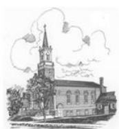
DONATE TO HELP RENOVATE

Townley Church needs help to fund several significant repairs. We appreciate your donations to our "Cherish The Church" Capital Improvement Campaign.