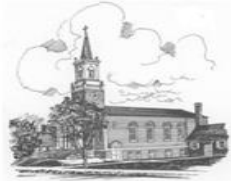
DONATE TO HELP RENOVATE

Townley Church needs help to fund several significant repairs. We appreciate your donations to our “Cherish The Church” Capital Improvement Campaign.