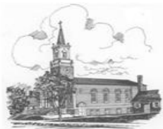
DONATE TO HELP RENOVATE

Townley Church needs help to fund several significant repairs. We appreciate your donations to our "Cherish The Church" Capital Improvement Campaign.